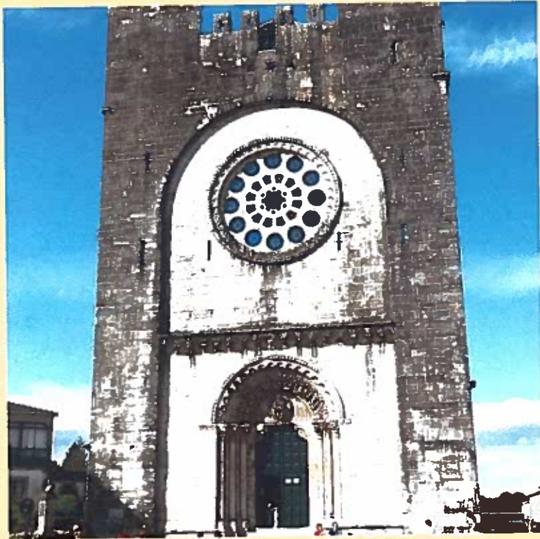
San Nicolas Church, Portomarin The church was moved, stone-by-stone, from its original riverside location, to the hilltop town of "new" Portomarin, so the river could be flooded to provide water for crops.